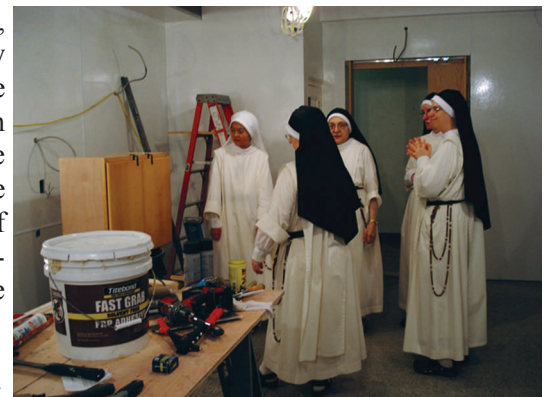
The sisters move one of the new cabinets into the kitchen to "check out" what it will look like against the new fiberglass walls.

To follow the developments of the project, and for photos and updates, visit our special capital campaign website: www.futurefullofhope.com .