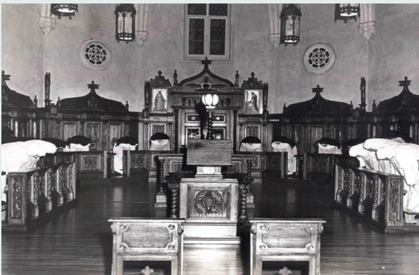
The nuns make the Medium Inclination during one of the offices of the Liturgy of the Hours.