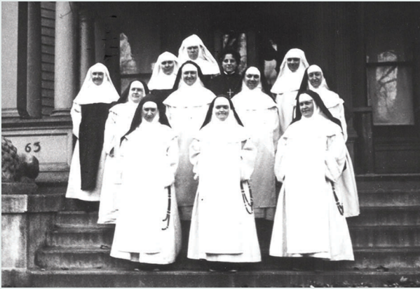
A photo of our foundresses on the steps of the new monastery on New England Avenue, Summit, on October 2, 1919.