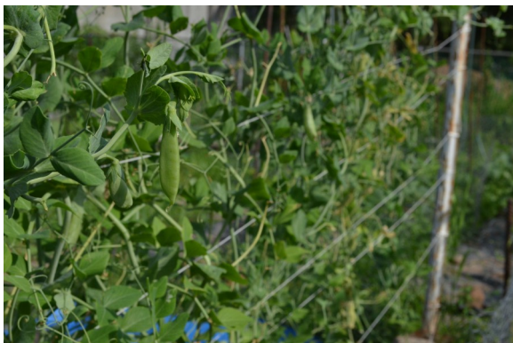
Snap peas — our earliest crop, which we started harvesting in June