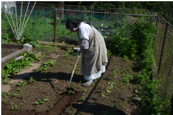
Getting ready to plant beans