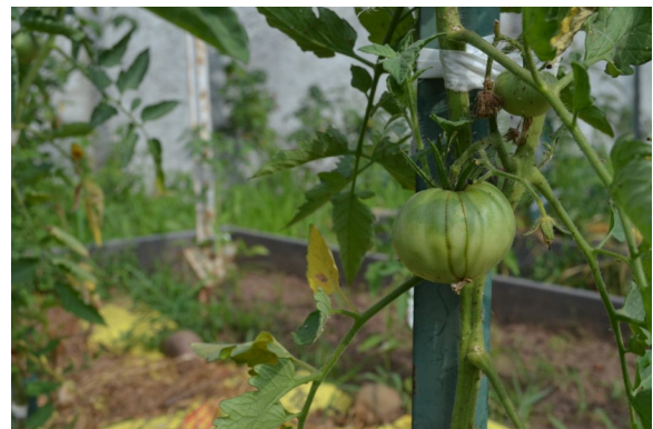
The tomatoes aren't ripe just yet